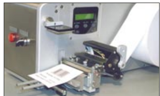
Linerfree® table model