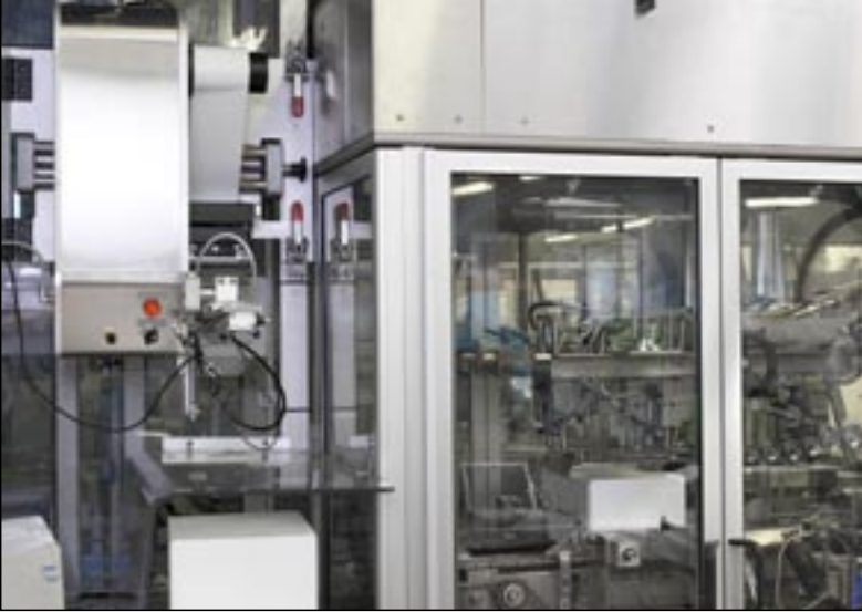
One-to-one labelling in packing machine (Tulip Food Company) Linerfree® Labeller