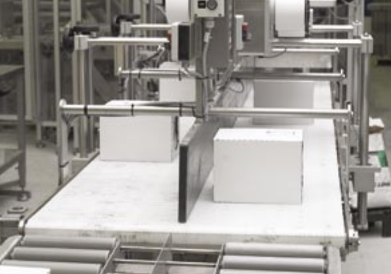
Top labelling (Tulip Food Company) Linerfree® Labeller