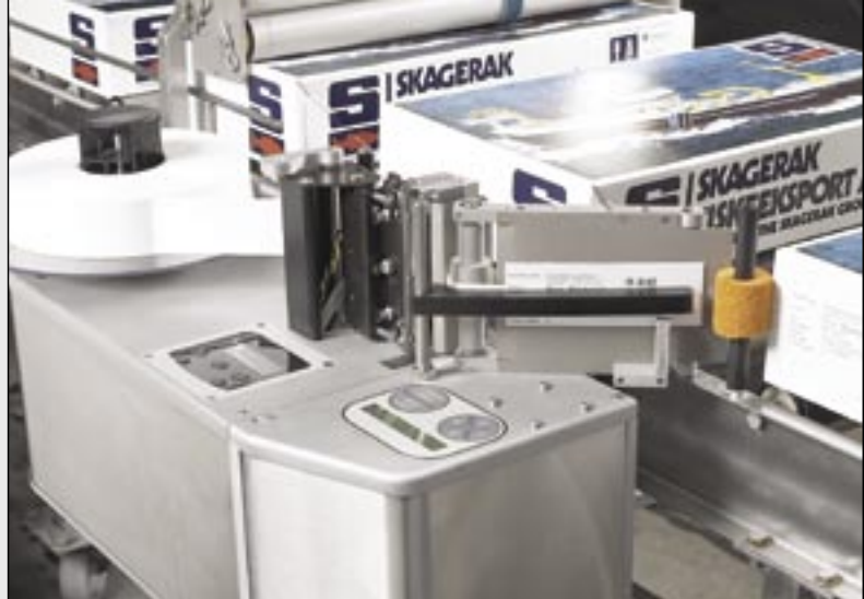
Side labelling (Skagerak Fiskeeksport) Linerfree® Labeller